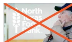
Do not use the reversed logo on photography with insufficient contrast.