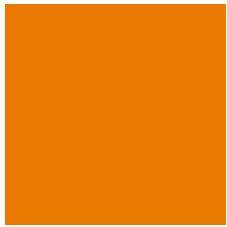
Primary Orange PMS 144 C/U 233r 121g 0b 0c 50m 100y 0k #E98300