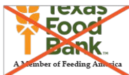
Do not set the Feeding America tagline with the logo. Use one of the approved Member of Feeding America logos.