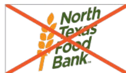
Do not distort/redraw the logo.