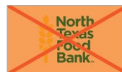
Do not use the logo on solid background colors that make any part of the logo difficult to see.