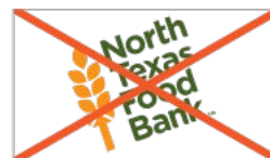
Do not rotate the logo.