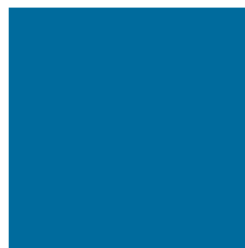
PMS 653 C/301 U Or 107g 157b 85c 30m 0y 31k #006B9D