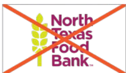
Do not change the logo colors.

Below are some examples of incorrect usage of the NTFB logo. These examples apply to all versions in the NTFB logo library.