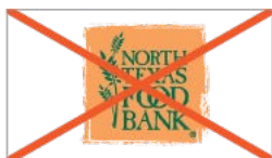
Do not use old NTFB logos.