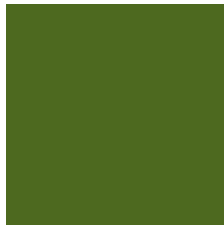
Primary Green PMS 371 C/U 83r 104g 43b 53c 14m 89y 56k #53682B

NTFB’s color palette reflects our optimistic outlook. Our primary color palette for all marketing and advertising materials is Primary Orange and Primary Green . A secondary color palette is available to work in conjunction with the primary palette.