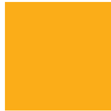
PMS 130 C/129 U 251r 173g 24b 0c 36m 100y 0k #FBAD18