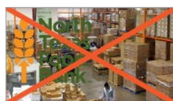
Do not use the logo over dark, complex photography if legibility is an issue.