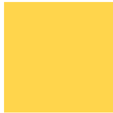
PMS 129 C/128 U 255r 213g 76b 0c 15m 81y 0k #FFD54C