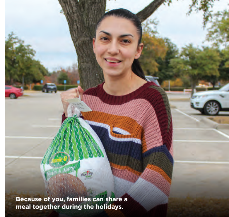
Because of you, families can share a meal together during the holidays.