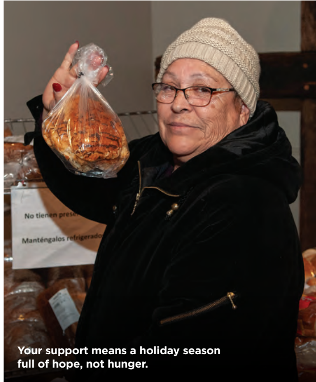
Your support means a holiday season full of hope, not hunger.

With your support, our neighbors won't have to face hunger this holiday season