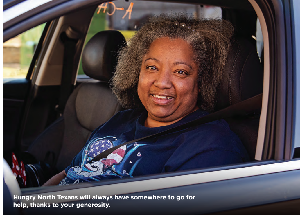
Hungry North Texans will always have somewhere to go for help, thanks to your generosity.