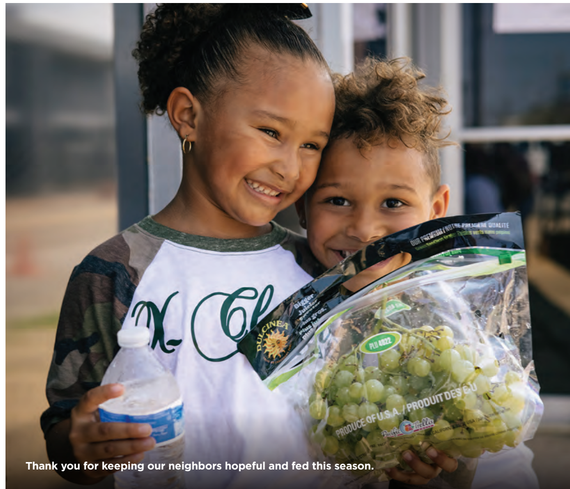
Thank you for keeping our neighbors hopeful and fed this season.

Want to learn more about becoming a monthly donor? Visit ntfb.org/mealmakers .